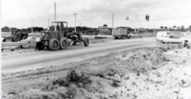
Fort Lauderdale construction