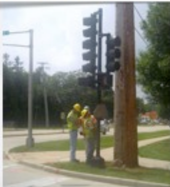
This is what taxpayers pay for. . .