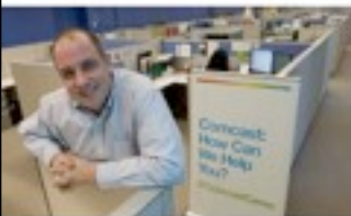
Enlarge By Eileen Glass, USA TODAY

Updated 11/18/2008 4:08 PM | Comments 21 | Recommend 7 | E-mail | Save | Print | Reprints & Permissions | RSS